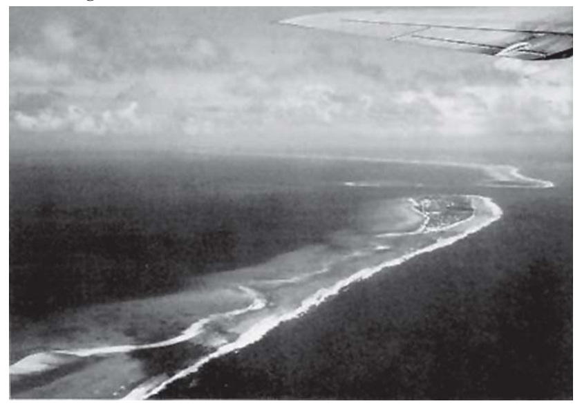
FIGURE 1. Portion of Enewetak Atoll, Marshall Island. To the right of center is Perry Islet. It is the largest islet visible in the picture and has a length of 2.3 km. The shallow atoll lagoon is to the left of the reef while the deep ocean is to the right.