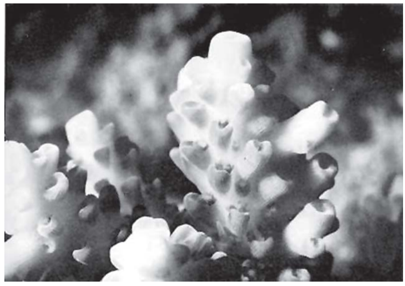
FIGURE 2. Closeup view of part of a coral tip of Acropora formosa from the lagoon of Enewetak Atoll. Each one of the "cups" on the tip harbors a single coral organism. The tip is about 25 mm long.

The question of the rate of coral reef growth is of considerable interest not only because reefs are incipient navigational hazards, but also because of the time required to build these large structures. A number of unsolved questions related to slow rates of subsidence or sea level rise and rapid rates needed to drown a reef (e.g., Schlager 1979) are of considerable academic interest. Some also wonder if the few thousand years proposed for life on earth in a biblical context can account for the growth of these huge structures. The Great Barrier Reef of Australia does not appear to pose a problem here. While it is over 2000 km long and up to 320 km offshore, drilling operations down through this structure have run into quartz sand (a non-reef type of sediment) at less than 200 meters (Stoddart 1969), indicating that it is a very shallow structure that does not necessarily require a vast amount of time for development. On the other hand, drilling operations on Enewetak (Eniwetok) Atoll (Figure 1) in the Western Pacific have gone through 1405 m of apparent reef material before reaching a basalt rock base (Ladd & Schlanger 1960). The rates of growth assumed by most investigators would dictate that at least scores of thousands of years would be required to grow a reef this thick. We shall evaluate the basis for these rates but will first consider a few of the peculiarities of the organisms involved.