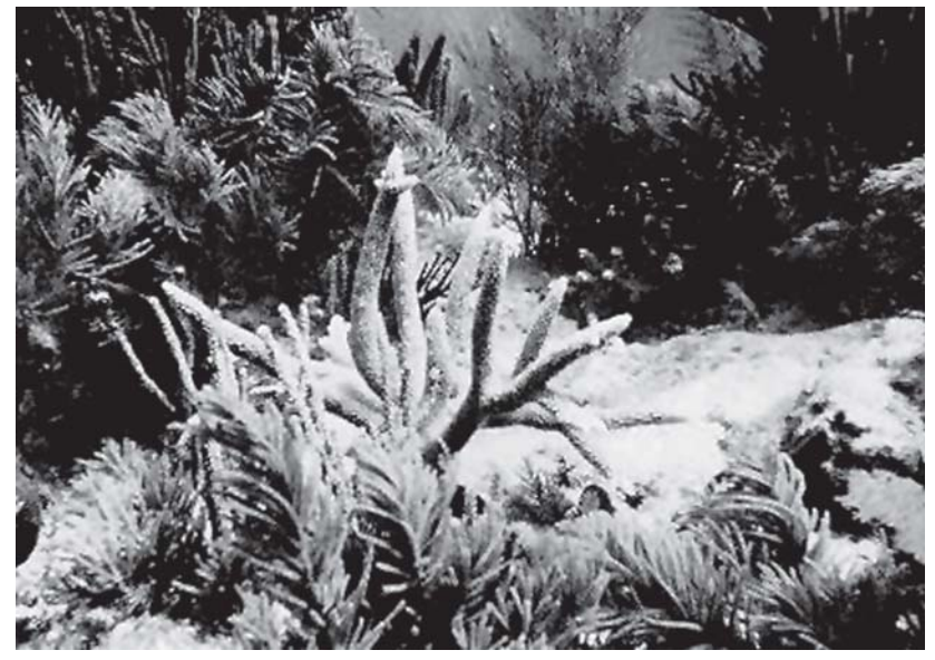
FIGURE 4. Isolated colony of Acropora cervicornis near the Florida Keys. This species has been reported to grow as fast as 260 mm/year. The colony is about 40 cm high. A large number of soft coral surround this colony.

point out that the reef can act as a filter, trapping some of the suspended carbonate load from the seawater passing through. Apparently, sediments on or near the bottom of the ocean could also contribute to reef growth, since Lonsdale, Normark & Newman (1972) found that the net movement of sand along the sides of Horizon Guyot (a submerged flat-topped mountain reaching up 3 km from the Pacific Ocean floor) is upslope , being moved up by tidal currents. Under similar circumstances, some of the rapidly growing coral near the surface of a reef (Figure 3) would facilitate more rapid carbonate deposition by trapping sediments brought upslope along the reef. In this situation the live coral would not have to build the entire mass of the reef, but only build a framework to hold the sediments.